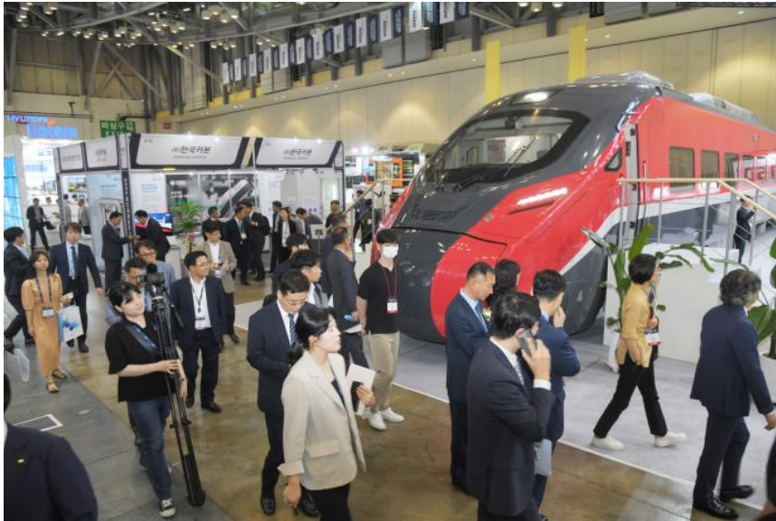
DAWONSYS EMU-150 on display at RailLog Korea